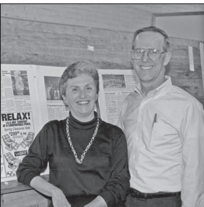
by PHIL NELSON